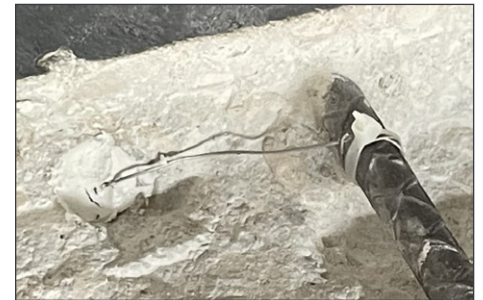
PatchGuard 175 connected to reinforcement

The PatchGuard 175 anodes were installed along the perimeter of the repairs to ensure mitigation of the corrosion and extend the service life of the repairs. Due to PatchGuard's placement in the native concrete, there were no restrictions to the repair mortar selection providing residents with the highest quality restoration.