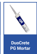
DuoCrete PG Mortar