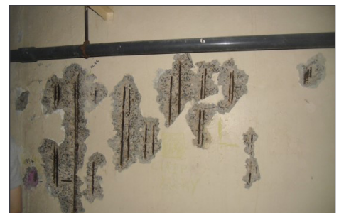
Corrosion found on the pool walls and walkway soffits

The discrete nature of the anodes means that concrete obscured by complex pipework can still be protected by the anode system.