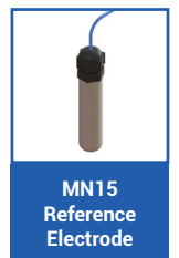
MN15 Reference Electrode