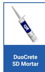
DuoCrete SD Mortar