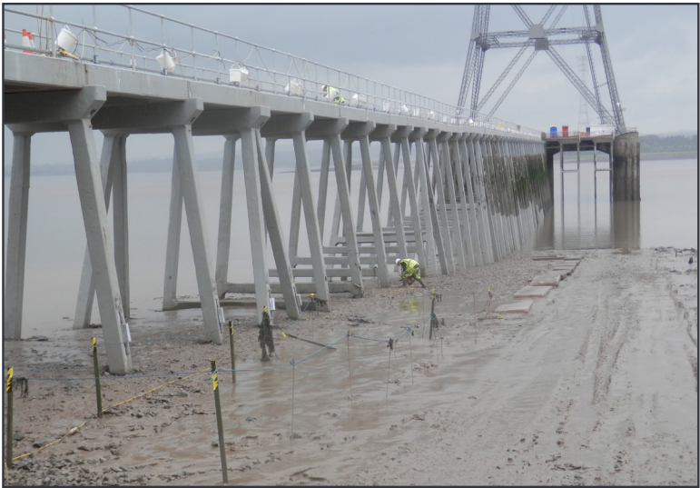
Bulk anodes in tidal zone.

The DuoGuard system was selected due to the 25 year design life offered, speed and simplicity of installation, the supporting technical data, the technical support offered by CPT and, most critically, the absence of exposed and vulnerable power and control equipment associated with ICCP.