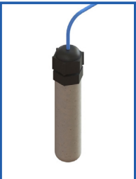
MN15 Reference Electrode