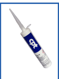
DuoCrete SD Mortar