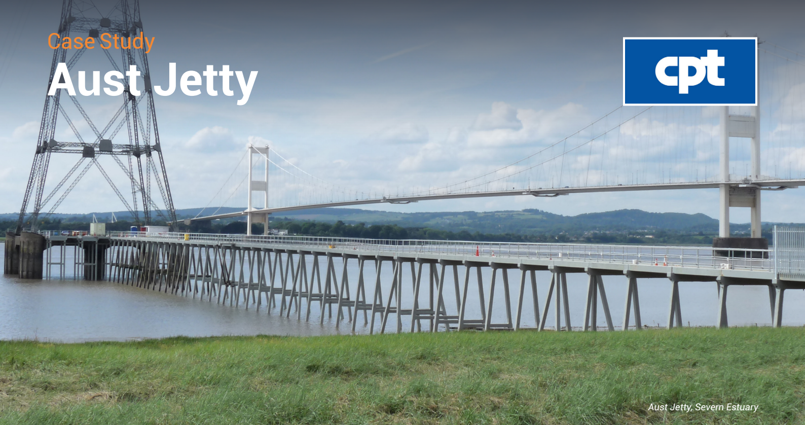
Aust Jetty, Severn Estuary