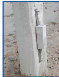
CPT Bulk Anode