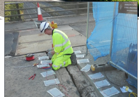
Onsite installation of ProtectorJoint™

The risk of corrosion related deterioration around the expansion joints at Lilley Bottom Bridge has been mitigated. The simplicity and speed of installation meant that the ProtectorJoint anodes could be installed into two bridge joints during a single night closure. The ProtectorJoint™ system is self-powered thus minimising future maintenance requirements and associated life costs. The ProtectorJoint™ system will provide effective corrosion control for a life of up to 20 years.