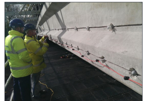
Sherbourne Bridge anode installation

Corrosion related deterioration of Sherbourne footbridge has been halted. After the initial power up period using an external power source, the DuoGuard system is self-powered thus minimising future maintenance requirements and associated life costs.