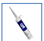
DuoCrete SD Mortar