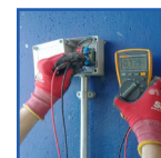
CPT Monitoring System