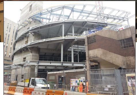
Birmingham New Street Car Park

Corrosion related deterioration of the Birmingham New Street multi story car park has been halted. After the initial power up period using an external power source the DuoGuard system is self-powered thus minimising future maintenance requirements and associated life costs.