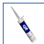
DuoCrete SD Mortar