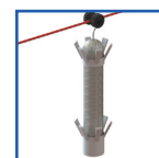
DuoGuard™ 500 & 750