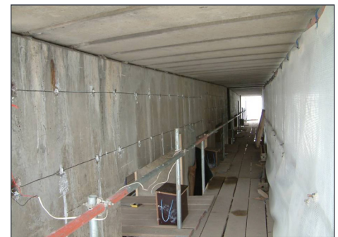
Temporary impressed current phase

Corrosion related deterioration of Laverock Hall Bridge has been halted. After the initial power period using an external power source, the DuoGuard system is self-powered thus minimising future maintenance requirements and associated life costs.