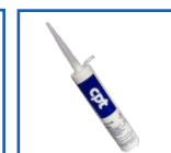
DuoCrete PG Mortar