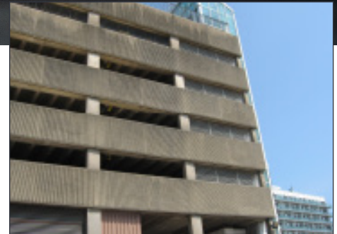
Grosvenor MSCP Car Park

Corrosion related deterioration of Grosvenor multi-story car park has been halted. PatchGuard anodes are compact, simple and quick to install causing minimum disruption. Placed within the host concrete for enhanced current distribution PatchGuard anodes provide low maintenance, long term protection of concrete repairs. The system is self-powered, minimising future maintenance requirements and associated life costs. The risk of secondary corrosion around the perimeter of the concrete patch repairs has been mitigated thus significantly extending the life of the patch repairs.