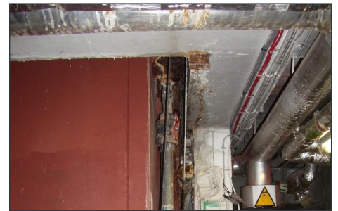
Chloride corrosion to the underside of the pool

Traditional methods of repair to historic structures are often costly and disruptive with only short to medium term results expected. DuoGuard hybrid anodes offer a long term and minimally intrusive alternative solution to managers of heritage assets.