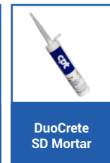
DuoCrete SD Mortar