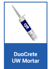
DuoCrete UW Mortar