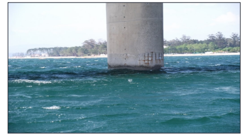
Steel corrosion in the piers

Corrosion related deterioration of Arousa Island Bridge has been halted. After the initial power up period using an external power source the DuoGuard system is self-powered thus minimising future maintenance requirements and associated life costs.