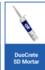
DuoCrete SD Mortar