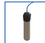
MN15 Reference Electrode